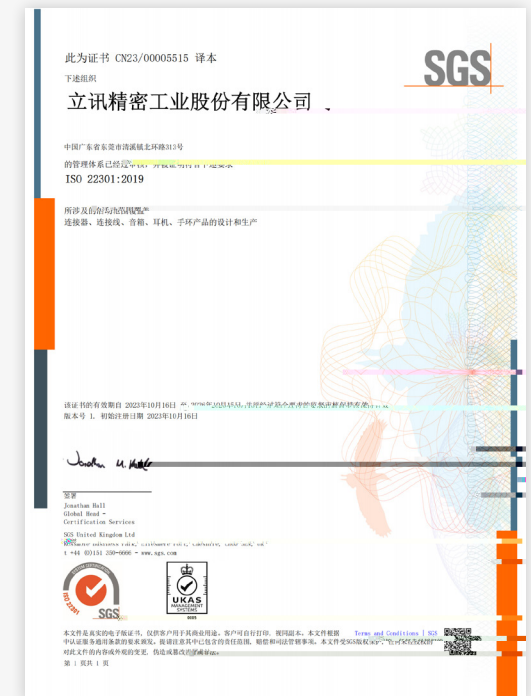
ISO 22301 Business Continuity Certificate

After undergoing a rigorous review, the Company was successfully certified by ISO 22301 for business continuity, providing a robust guarantee for the Company's steady operations.